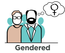
Gendered clan system

This infographic is based on a case study published by the Inclusive Peace & Transition Initiative (IPTI) as part of the series "Women in Peace and Transition Processes" that analyzes the conditions under which women participated in and influenced peace, political reform, and constitution-making processes worldwide. To discover other infographics and our case study series, visit our website: www.inclusivepeace.org