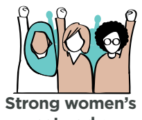
Strong women's networks