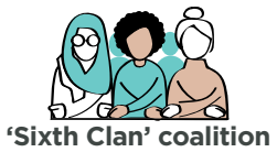
'Sixth Clan' coalition