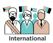
International policy debate