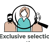
Exclusive selection practices